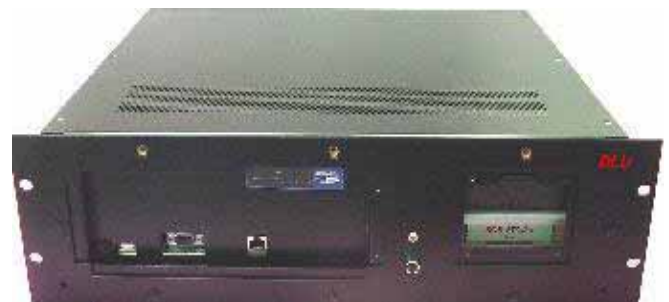
19" 4U Rack mounted unit

BES Systems has successfully integrated FDLUs on Shipboard Command & Control in various countries. Upon order, BES integrates the FDLU with the ship C2 system for maximum optimization.