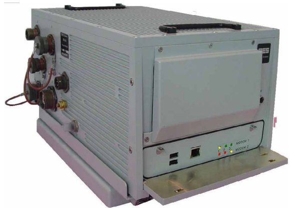
Fully Naval rugged system

Units are made from high reliability hardware and Pentium M CPUs.